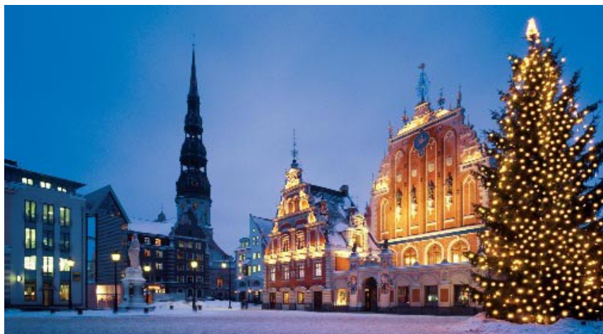
Town Hall Square, Riga

It was in the year 1510 that a number of black-hatted merchants placed flowers on the fir tree in the Old Town of Riga, one of the Baltic states. It's likely that these men were linked to the Society of Unmarried Men who owned the beautiful Black Head House in the Town Hall Square. When the celebrations were over they burned the tree. Historians believe that this was the start of the tradition of decorating Christmas trees. In year 2010 Riga will celebrate the 500th anniversary of this tradition.